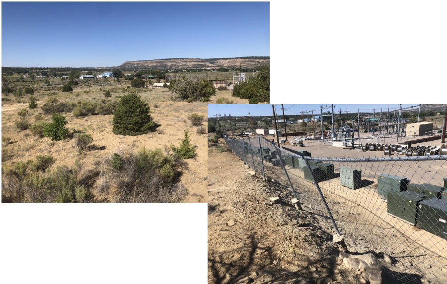
Future sight of the Cuba Solar Array project and a need for the redesign and expansion of the JMEC operations yard due to erosion.

More news to report on this exciting Co-op project in future newsletters.