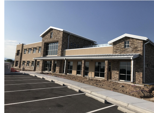
JMEC Building near complete. Business operations at the new facility opening soon, Courtesy photo.

"Rate 14" information can be found at the NMPRC website: http://www.nmprc.state.nm.us/ - Final Order Granting Joint Motion to Dismiss Formal Complaint in Case No. 19-00225-UT.