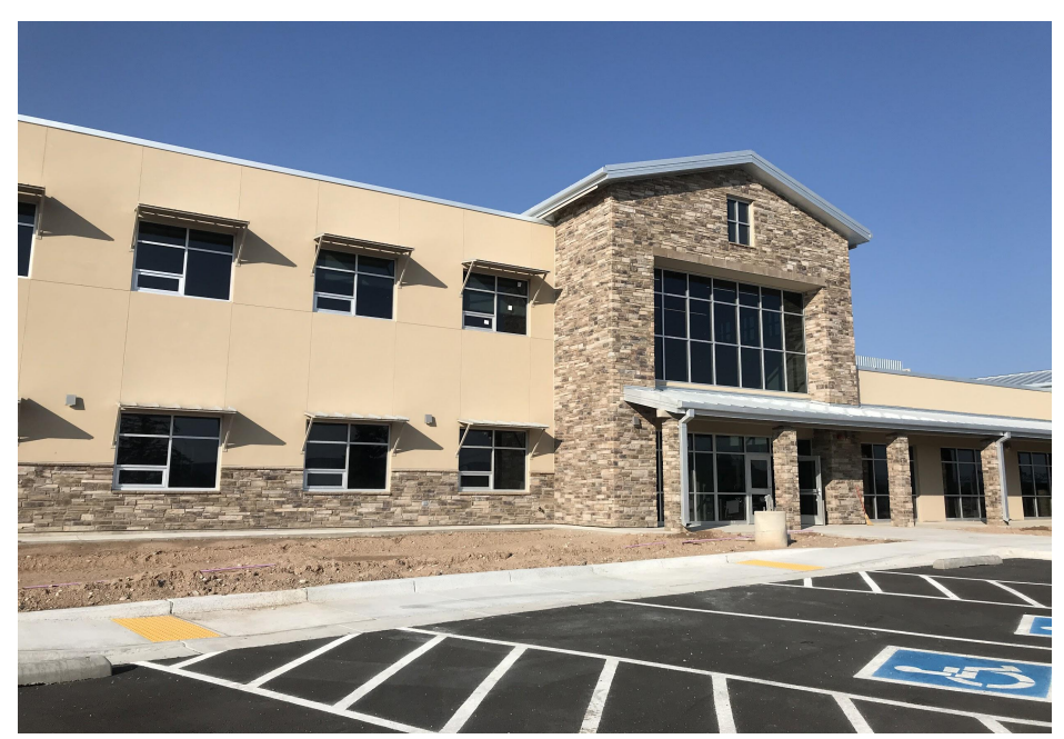
New JMEC headquarters near complete. See page 2 for full story in this month's edition.