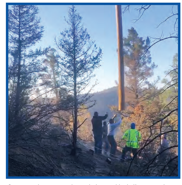
Crews reach up to steady a pole lowered by helicopter and place it in a hole prepared for its setting – one of 26 poles replaced as a result of the Rio en Medio fire which started several miles away from JMEC lines.