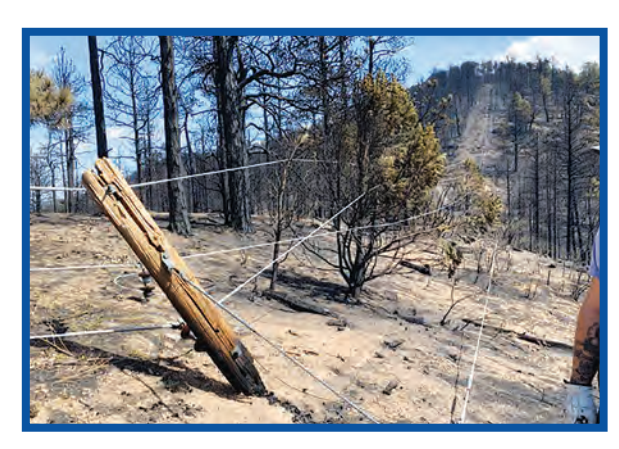
The Rio en Medio fire, started some miles from JMEC lines, burned poles from the bottom up so, all that is left holding it together are the lines.