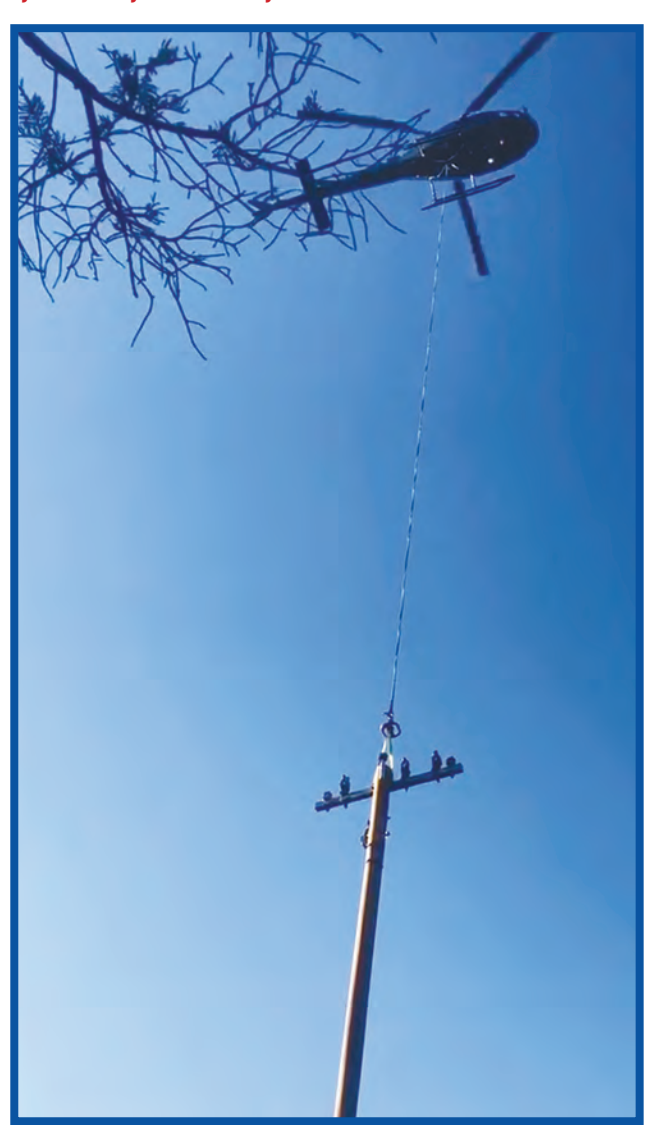
Some areas in JMEC service territory are so remote pole replacements have to be helicoptered in.

JMEC is thrilled that this work is underway. The schedule is aggressive and supply chain delays are still a factor (it can take three years between ordering and receiving a new transformer) but neither will get in the way of the cooperative's commitment to system safety and reliability.